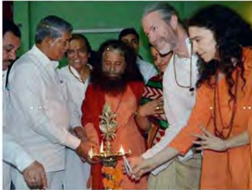
Chief Minister of Uttarakhand Harish Rawat along with other dignitaries participate during the inaugural ceremony of the eco-friendly Brightland International School rebuilt by the Divine Shakti Foundation — Parmarth Niketan (Rishikesh) in Uttarakhand's flood-affected Chandrapuri in Rudraprayag, on Sunday. #11

Like Share 3 Tweet 0 +1 0 in Share Print Share 1