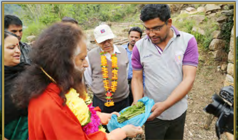
Pujya Swamiji is shown local medicinal plants and herbs, growing in abundance in the village