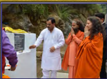
Sacred Memorial Garden in Kedarnath