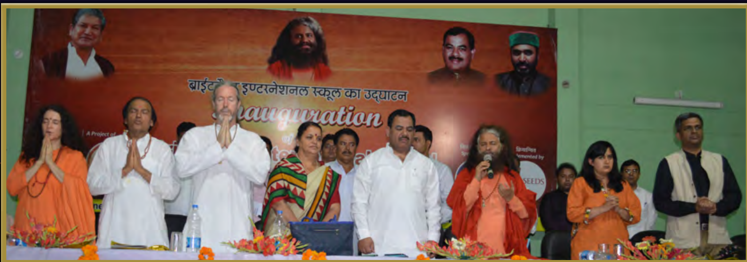
A special peace prayer and homage was led by Pujya Swamiji during the Brightland International School Inauguration in memory of the thousands of departed souls in the Uttarakhand flash floods of 2013.

Among the unique features of the school are eco-friendly bio-toilets and WHO-approved bio-sand filters for clean water.