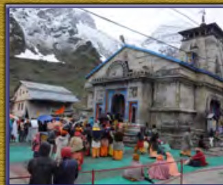
Darshan at Holy Kedarnath