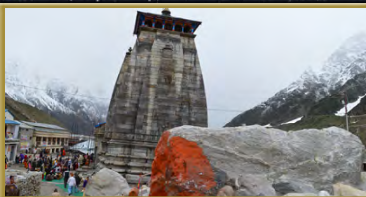
The divine rock that some say miraculously saved the Kedarnath Temple by blocking the torrential river and diverting its fury away