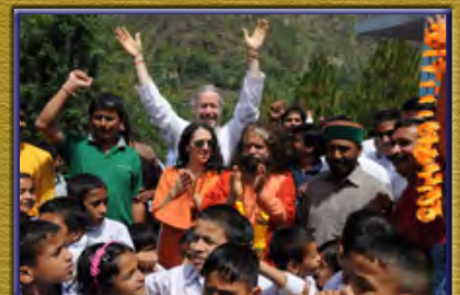
A Beautiful New School in the Flood-Devastated Himalayas