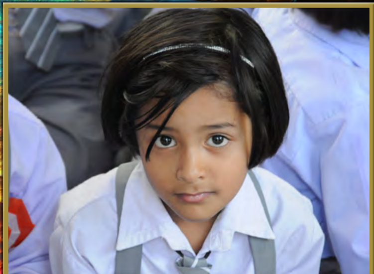
An adorable young student at Brightland International School, who has now been given an opportunity to regain access to quality education