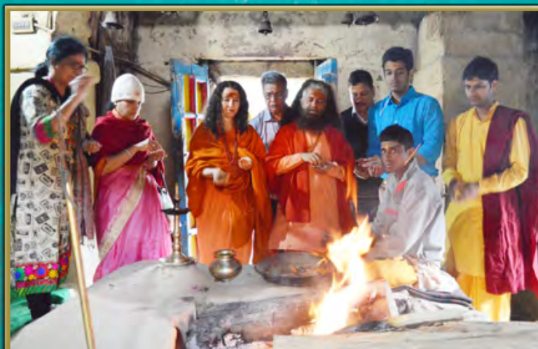
Darshan at a sacred temple in nearby Triyugarayan, where it's said that Shiva and Parvati were married before the holy fire