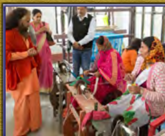
Enabling Self-Sufficient Lives for Disaster Widows