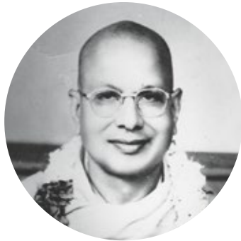
HH PUJYA SWAMI SHUKDEVANAND SARASWATIJI