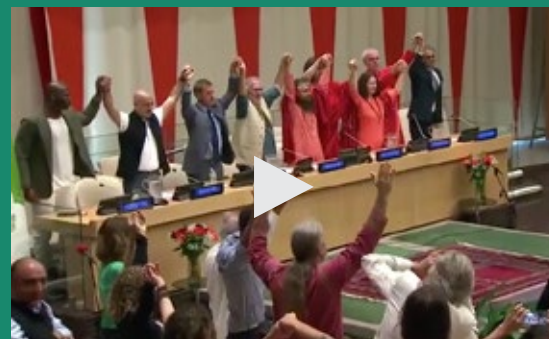
Full video of “Conversation on Yoga for Health”