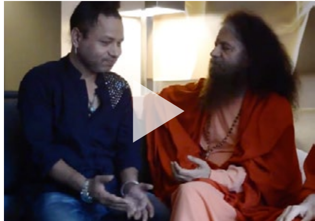
Pujya Swami Chidanand Saraswatiji shares a special song of devotion and love with our ever talented and beloved Kailash Kher in New York.