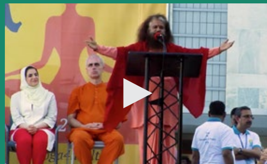
Full video of “Yoga Session with Yoga Masters”