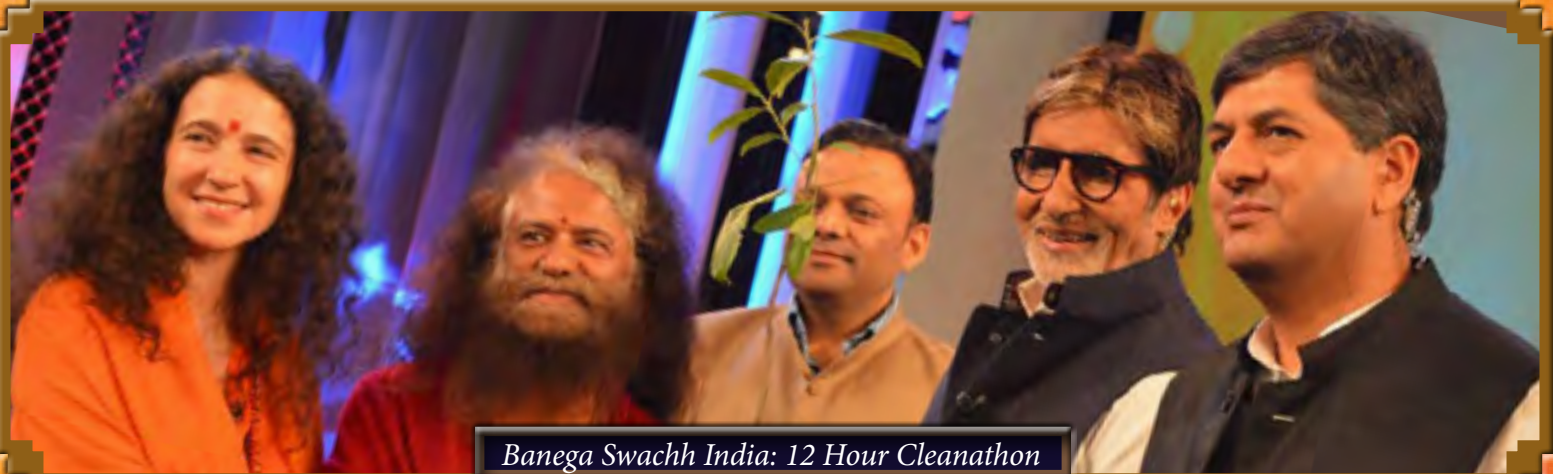
Banega Swachh India: 12 Hour Cleanathon