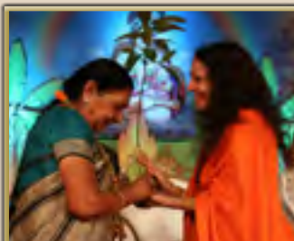
Swachh aur Sundar Gujarat (with Sadhviiji and CM of Gujarat)