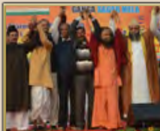
Clean and Green Ujjain Kumbha Mela. Simhastha 2016.