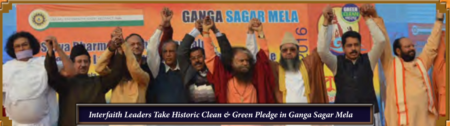
Interfaith Leaders Take Historic Clean & Green Pledge in Ganga Sagar Mela