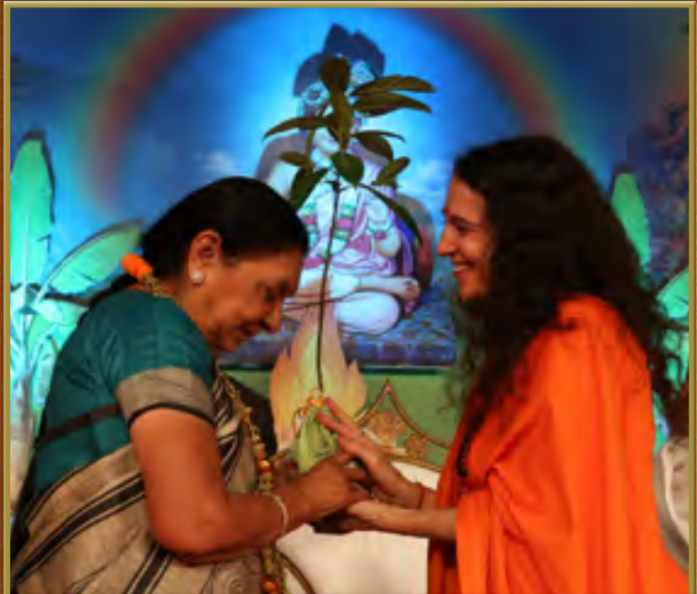
Sadhvi Bhagawati Saraswatiji giving rudraksh sapling to Hon'ble Chief Minister of Gujarat, Smt. Anandiben Patel