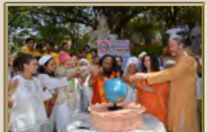
Holi Celebrations: Local Culture Connects to Global Community