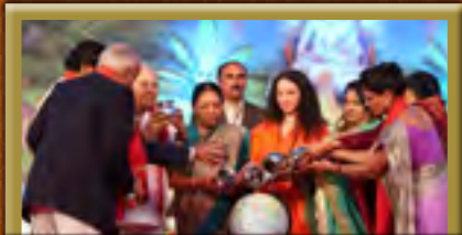
Sadhviji Bhagawati Saraswati leading Hon'ble Chief Minister of Gujarat, Smt. Anandiben Patel and other dignitaries in a water blessing ceremony