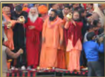
Haridwar Ardh Kumbha Mela for All