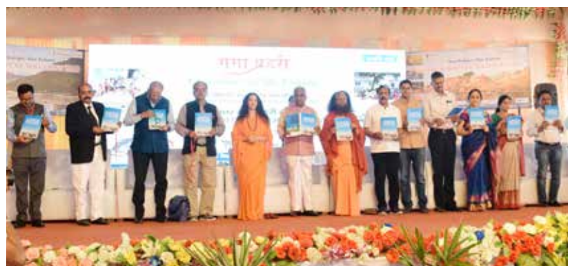
Launch of the Ganga Pahari workshop with Hon'ble Urban Development Minister of Uttarakhand Shri Madan Kaushik

On the second day, the Solutions Summit was joined by top officials from the National Mission for Clean Ganga, experts from the Wildlife Institute of India (WII), Dehradun and nearly 250 volunteers from Uttarakhand, Uttar Pradesh, Bihar, Jharkhand and West Bengal for the inauguration of the four-day Biodiversity and Ganga Rejuvenation Training Programme.