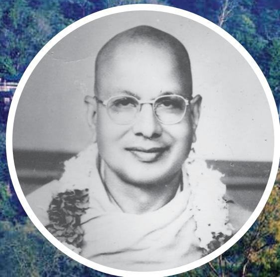
HH PUJYA SWAMI SHUKDEVANAND SARASWATIJI