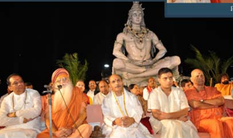
Pujya Swami Gurusharananandji