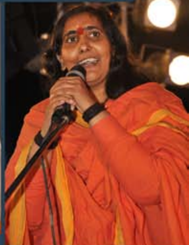
Pujya Sadhvi Ritambharaji