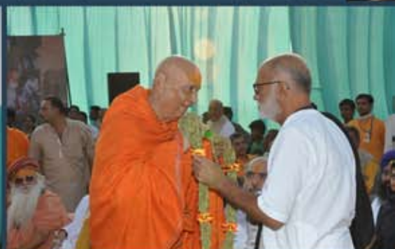
Pujya Swami Satyamitrnanandji and Pujya Morari Bapuji