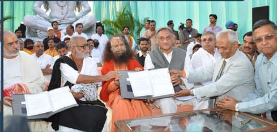
Signing of MoU between Ganga Action Parivar, FICCI and DRDO to build toilets in the Ganga Basin