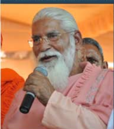
Pujya Goswami Sushilji