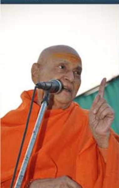
Pujya Swami Satyamitranandji