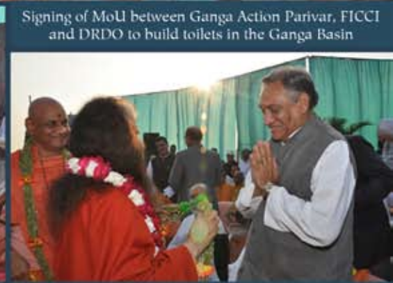
Shri Vijay Bahuguna, Hon'ble CM of Uttarakhand