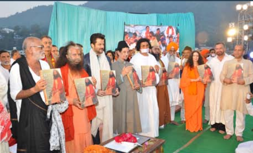
Release of Pujya Swamiji's biography By God's Grace