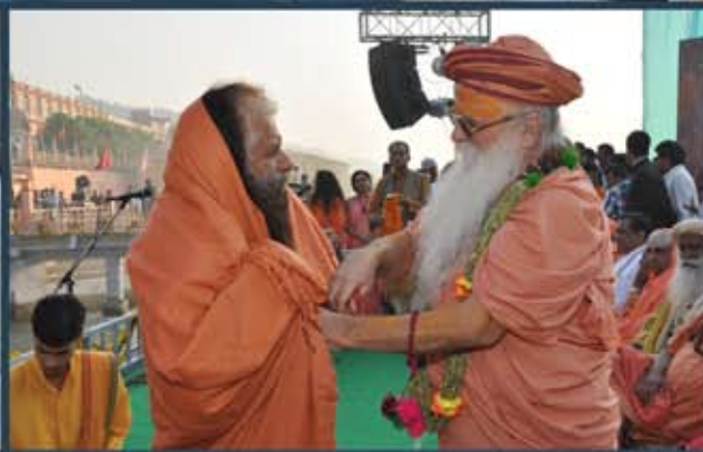
Pujya Swami Gurusharananandji