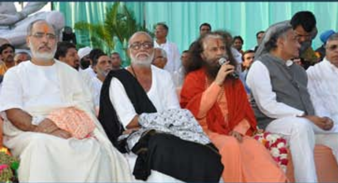
Pujya Bhaishri, Pujya Morari Bapuji, Pujya Swamiji and Shri Vijay Bahuguna