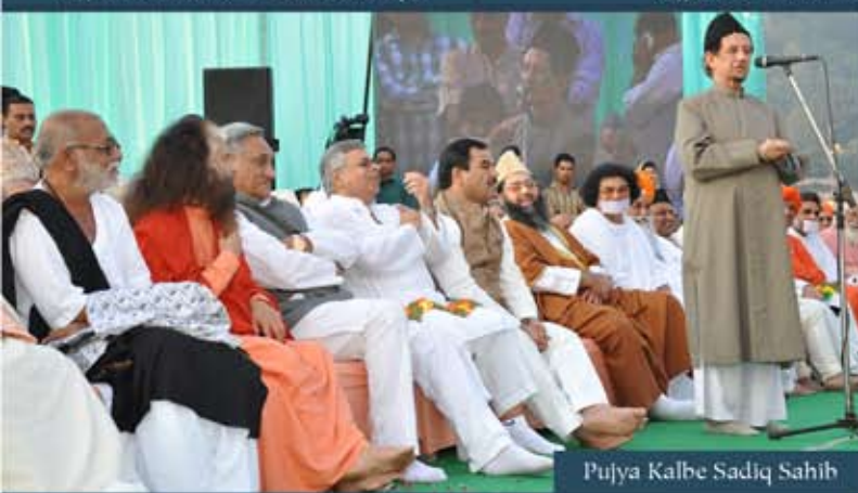
Pujya Kalbe Sadiq Sahib