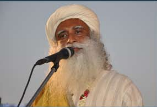
Pujya Sant Jaggi Vasudevji