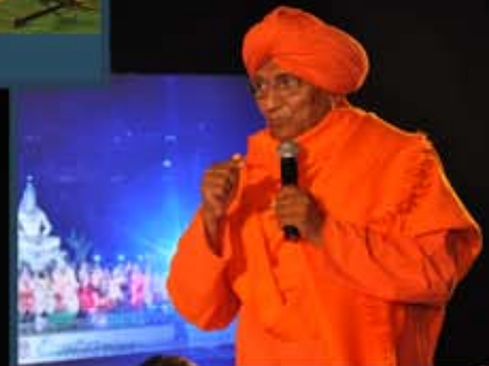
Pujya Swami Agniveshji