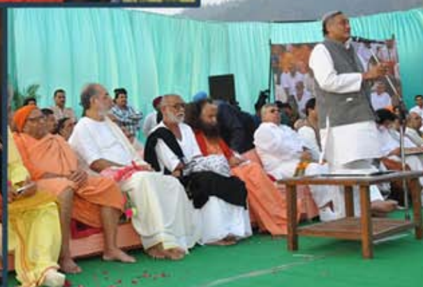
Shri Vijay Bahugunaji, Hon'ble CM of Uttarakhand