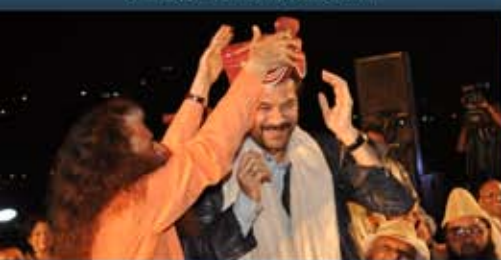
...and Pujya Swamiji placing it on Anil Kapoor!