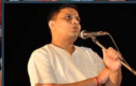
Pujya Acharya Balkrishnaji