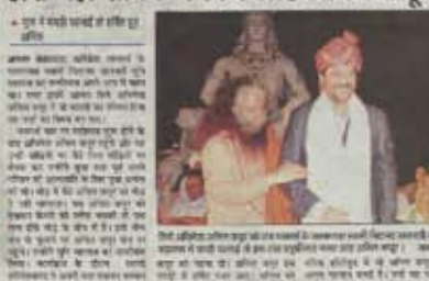
हीरो नहीं साधक बनकर आए अनिल कपूर