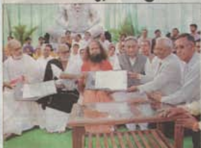
गंगा की प्रदूषण मुक्ति के उपाय पर हुई सहमति