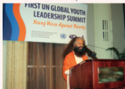
Speaking at United Nations Global Youth Peace Summit in New York