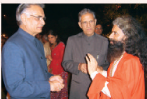
Discussing the Mansarovar project and Ganga Clean up with the Hon. Home Minister Shri Shivraj Patil and Shri B. L. Joshi the new Governor of Uttarakhand.