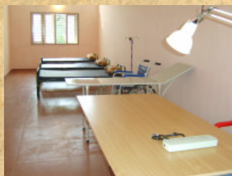
Medical Center with beds, wheelchair, instruments and medicines