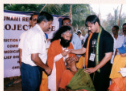
Free eye and medical camp