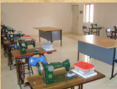
Vocational Training Center