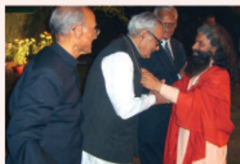
Giving a rudraksha mala to H.E. the Vice President of India, Shri Bhairon Singh Shekhawat