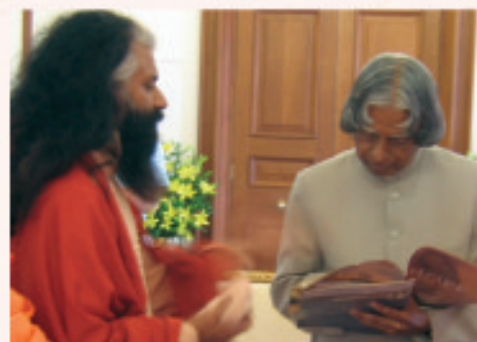
Discussing IHRF's projects with H.E. the Honorable President of India, Shri ABJ Kalam

IHRF's Founder/ Chairman shares wisdom, peace and inspiration across the globe