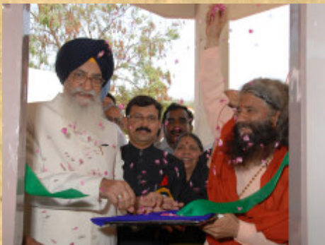
The Hon. Governor and Pujya Swamiji inaugurate the orphanage and talk to orphan children