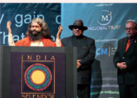
Giving Acceptance Speech for India Splendor Award at UCLA in California.