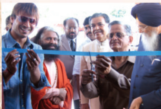
Official inauguration of Village Pannithittu

Project Hope also undertook the reconstruction of villages Pannithittu and Pattincheri in Pondicherry, totaling over 350 homes. Pannithittu was inaugurated in December 2005 by the hands of the Honorable Governors of Tamil Nadu, Pondicherry and Uttarakhand. Pattincheri, sponsored by Shri LN Mittal of London, was inaugurated in April 2007.