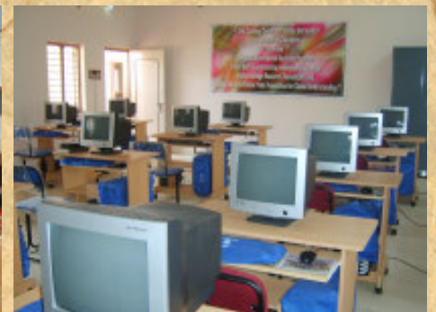
The Computer room for orphans and the ladies