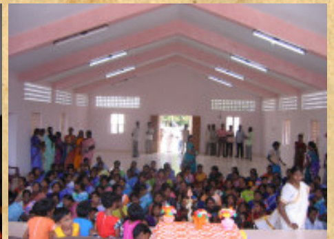
New dining hall complex