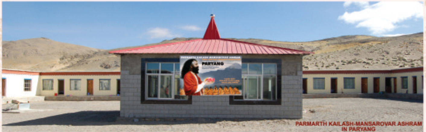
PARMARTH KAILASH-MANSAROVAR ASHRAM IN PARYANG

The ashram is already a boon for the town, as we hired local people for the construction and trained them in masonry, carpentry and painting. The ashram will be run and maintained also by local Tibetans. Further, proceeds from the ashram go back into the community, for education, health care and other projects.