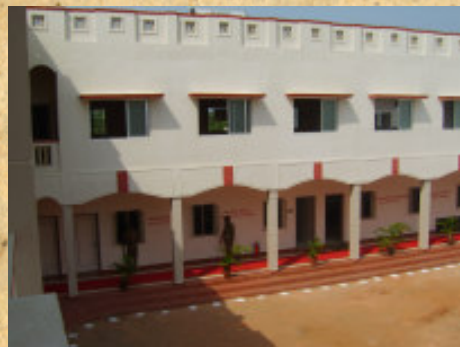
Two wings of the new orphanage