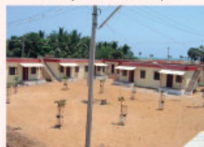
Newly reconstructed village of Pannithittu

Thanks so much to our generous donors who made this work possible, including: