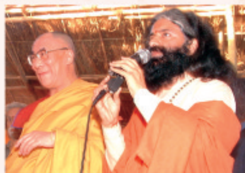
With H.H. The Dalai Lama