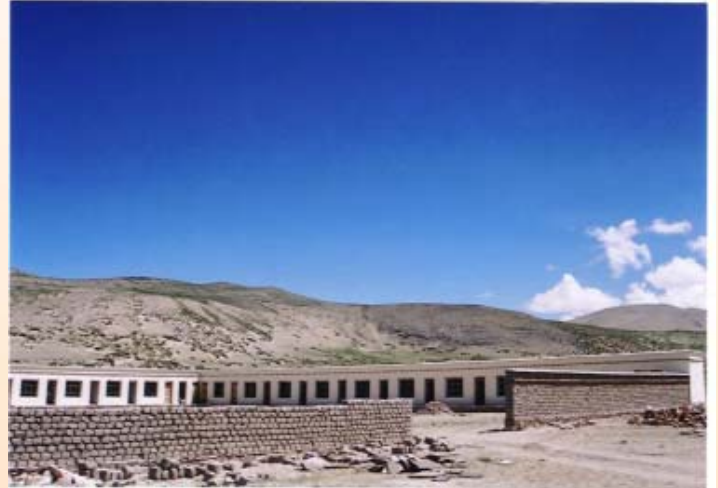
Parmarth Prayang Ashram nearly completed