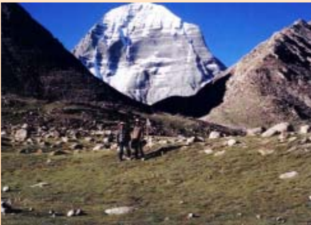
Land on which Dirapuk Ashram will be built