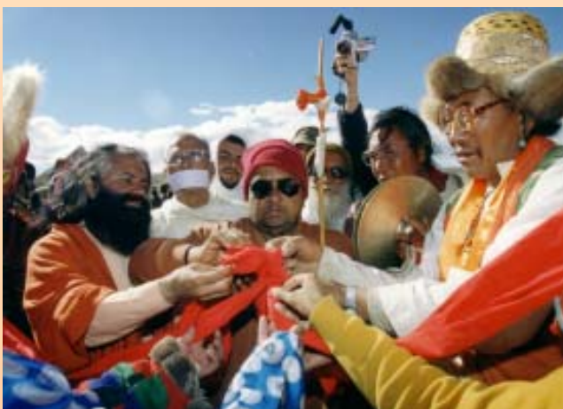
Ribbon opening ceremony

Since then we have also constructed 2 large halls on the same premises which can be used as a dormitory and also for meditation, satsang and puja.