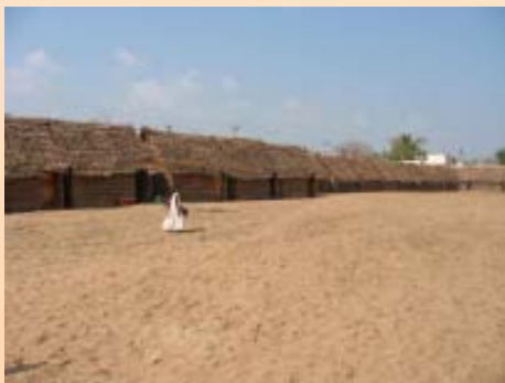
100 new temporary houses