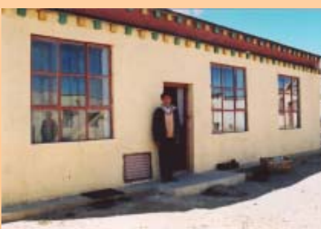
Medical Clinic room