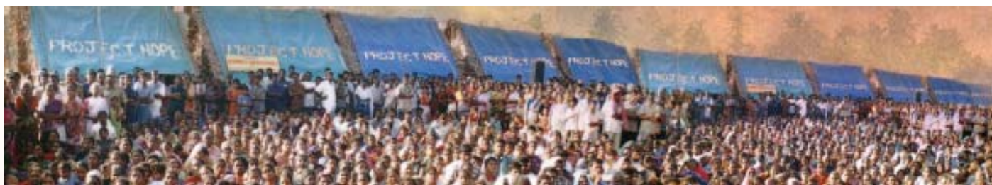
Thousands and thousands of villagers came to take part in the musical concert on the 15 January, on the grounds in front of the temporary houses we constructed