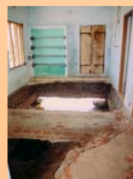
In the tsunami, the force was so strong that it ripped this Patancheri house out from the bottom up!

Patancheri is one of the largest villages of Pondicherry, in the district of Karaikkal. In this village, plans are underway - with the generosity and support of generous donors -- to reconstruct 350 homes as well as to build a school, vocational training center, computer center, community center and primary health care center. The vocational training center and computer center have already been started and construction of the homes is ready to begin any day.