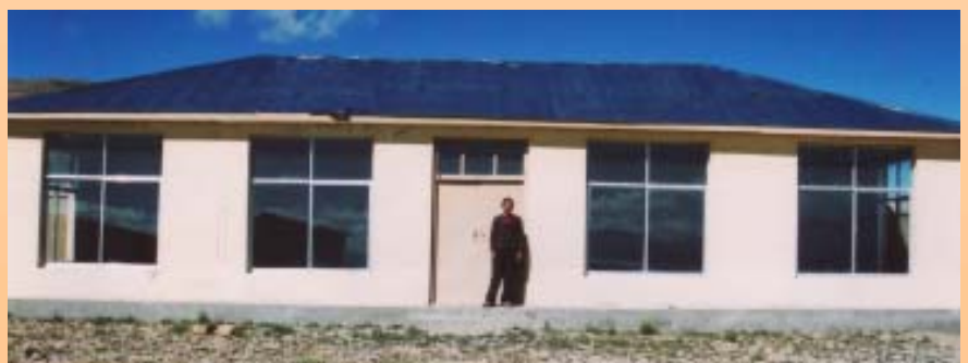
One of the halls