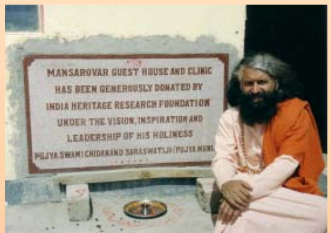
Pujya Swamiji in front of Reception room