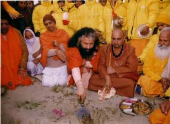
Bhoomi puja for Parmarth Prayang Ashram

At that time the ground breaking ceremony was also performed for the ashram in Prayang, which is now nearly completed.