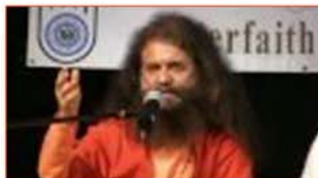
Peace Through Nonviolence