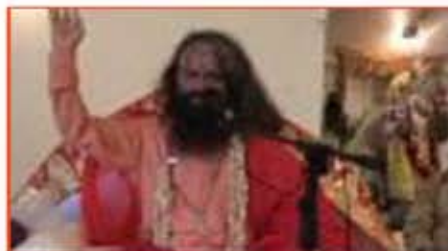
Power of Prayer & Divine Connection

...and click here to see even more videos online!