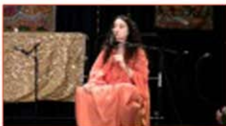
Sadhvi Bhagawati: Power of Thought