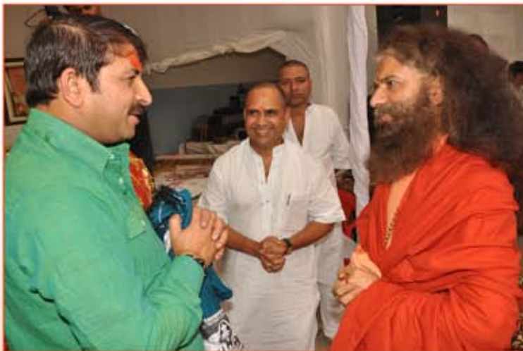
Puja Swamiji discussing ways to preserve and protect Gangaji with famous singer Shri Manoj Tiwari