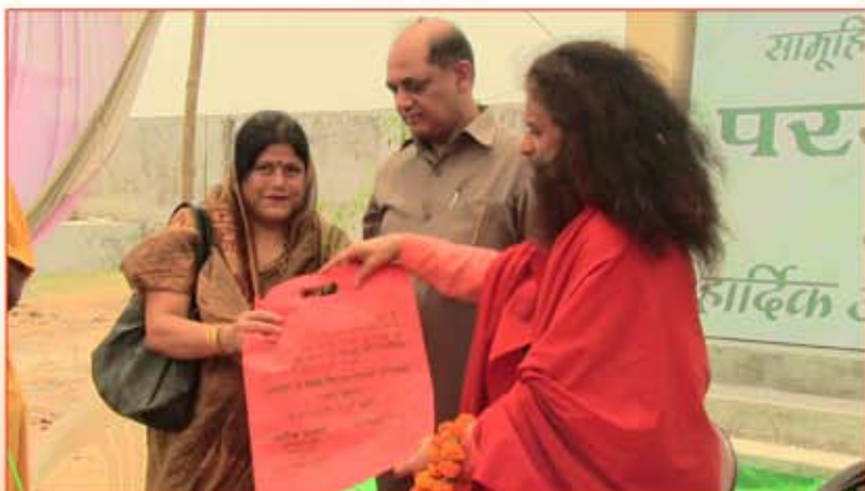
Pujya Swamiji and _____ present eco-friendly bags to the villagers, as alternatives to polythene

In Ganga Action's efforts to completely clean and restore the environment, eco-friendly bags were handed out to all the villagers who attended this inaugural ceremony. These reusable bags can be used as an alternative to plastic or polythene bags, which litter our Earth and clog our rivers, when one goes to the market or for any other purpose.