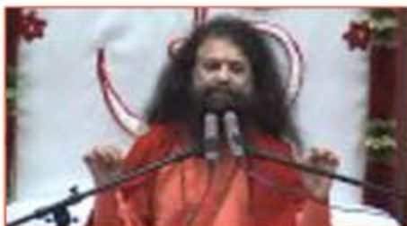
Guru Purnima 2011