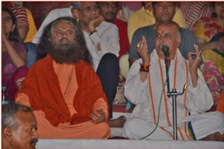
Shri Pravin Togadiaji, head of the VHP, speaking after the Ganga Aarti

After the Ganga Aarti, Shri Pravin Togadiaji, head of the VHP, spoke to the Aarti crowd, and Pujya Swamiji led the thousands gathered to take a pledge together to help protect and restore Gangaji.